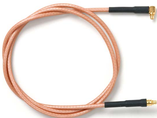
Model 73064 MMCX Plug to Right-Angle MMCX Plug, RG316/U

Snap-on coupling and micro-miniature size for fast connect and disconnect where space is limited